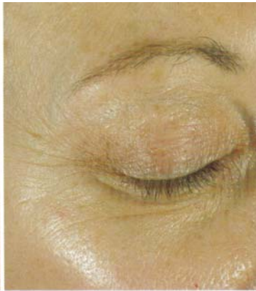
2 WEEKS after Obagi ELASTIderm™ Reduction of fine lines and wrinkles**