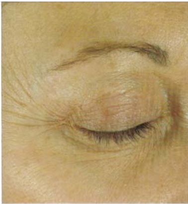
58-year-old female before Obagi ELASTIderm™