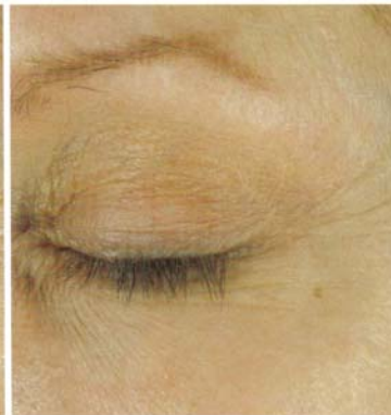
8 WEEKS after Obagi ELASTIderm™ Reduction of fine lines and wrinkles**

Patients in the clinical study were between 45 and 69 years old and had moderate to severe sun damage. Before and after photos were taken with a Canfield camera and have not been retouched.