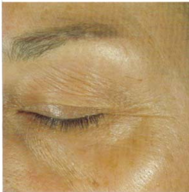
63-year-old female before Obagi ELASTIderm™