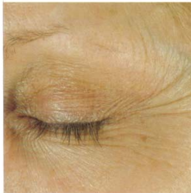
60-year-old female before Obagi ELASTIderm™