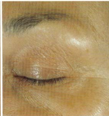
6 WEEKS after Obagi ELASTIderm™ Reduction in crepey skin**